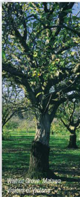
Walnut Grove, Malawa Visions of Victoria

A pretty ride, via tranquil roads in Robinson and Grasmere. It's a 60km return trip with an intermediate grading. At a leisurely pace, it can be completed in about four hours. You're finishing point will lead to Cosy Corner Beach, complete with picnic tables and barbecues under peppermint trees.