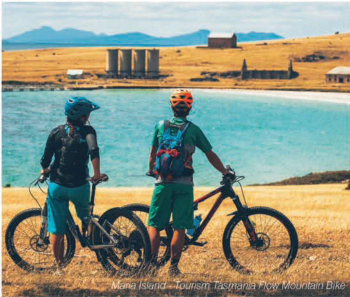
Maria Island - Tourism Tasmania Flow Mountain Bike

2 Triabunna Cabin and Caravan Park (03) 6257 3575 mariagateway.com