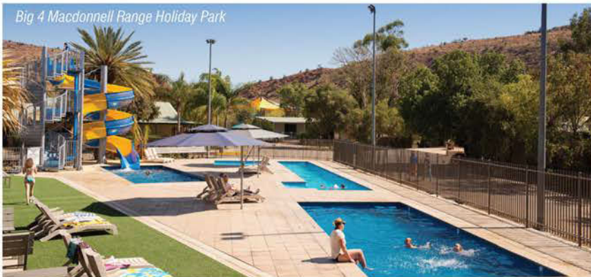
Big 4 Macdonnell Range Holiday Park

2 Wintersun Cabin & Caravan Park (08) 8952 4080 wintersun.com.au