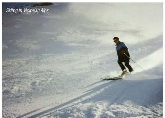
Skiing in Victorian Alps