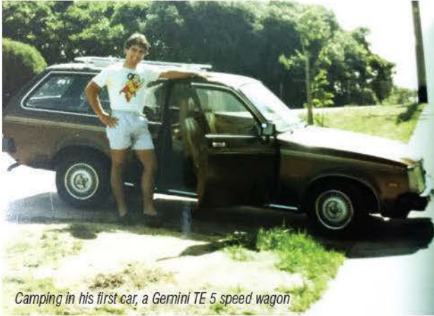
Camping in his first car, a Gemini TE 5 speed wagon