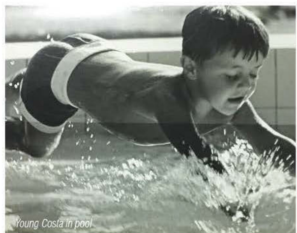
Young Costa in pool