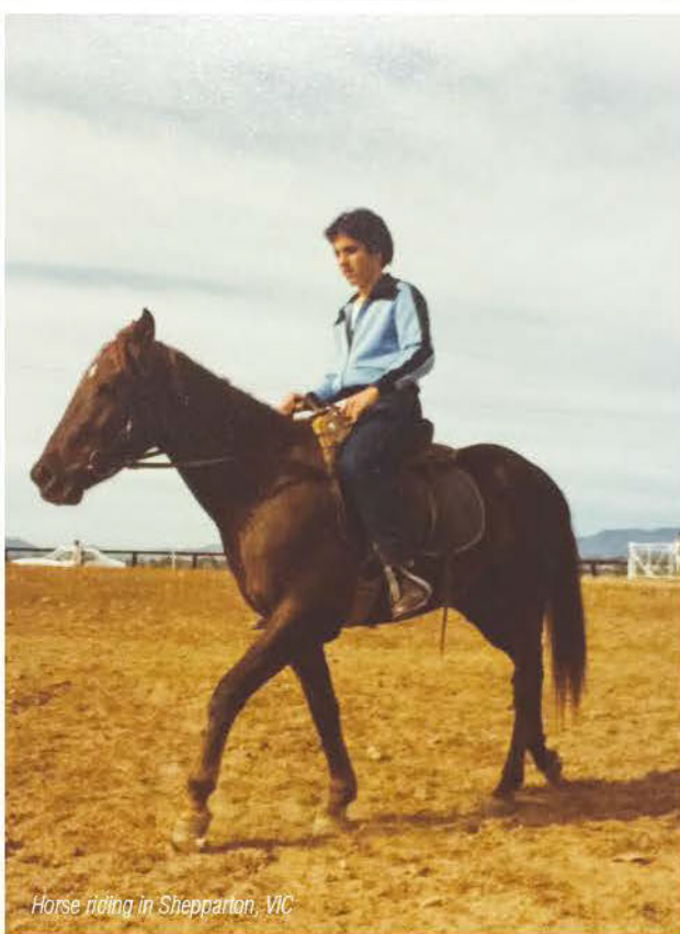
Horse riding in Shepparton, VIC