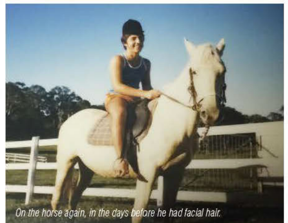
On the horse again, in the days before he had facial hair.

Definitely something elevated with views. Somewhere I could view the coast and have a river down to the ocean and still do things like canoeing. I need to merge all of those things together but I love that you can't. Wherever I go now I can appreciate, compare, and contrast where I move through. I get to enjoy the landscape for its diversity and differences. ♠