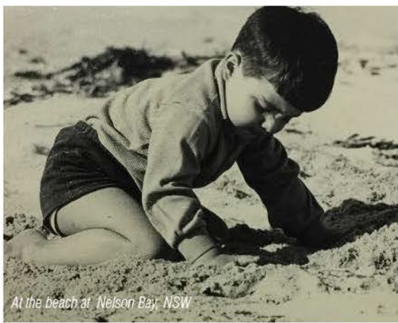
At the beach at Nelson Bay, NSW